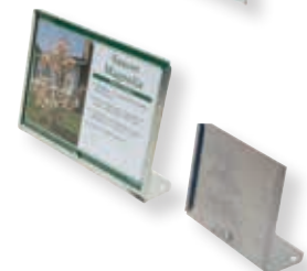
Table Top Sign Holder