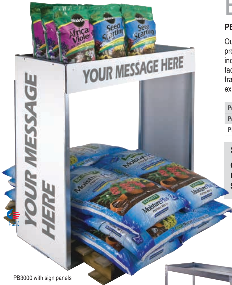
PB3000 with sign panels

Our new pallet bridge display provides an elegant solution to cross-merchandise products that are complementary to your palletized goods. Graphic panels (not included) simply slide into the side supports while mounting holes on the tray face easily accept most types of rigid signage panels. The galvanized steel frame fits over most standard pallets and the upper tray features flattened expanded metal to hold large and small products.